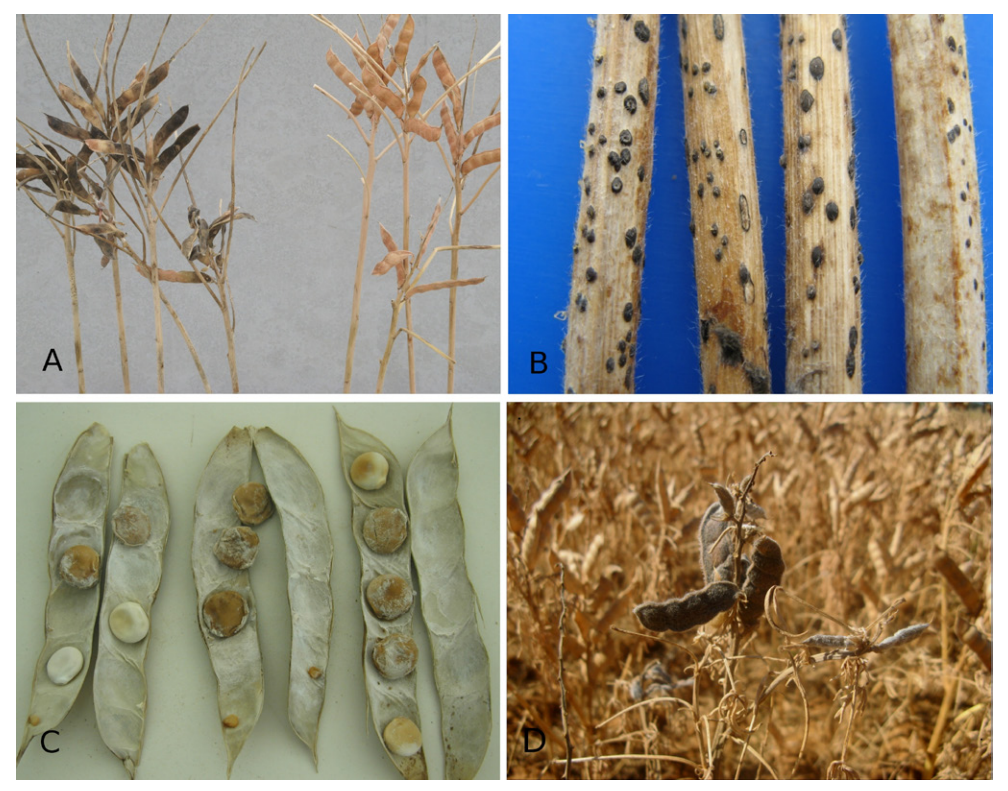
Figure 1: Effect of phomopsis on Albus lupins. A. Contrasting a resistant variety on right with a susceptible variety on the left. B. Characteristic pycnidia ("leopard" spotting) on L. albus stubble. Stems such as these will contain the toxins causing lupinosis. Infected stems look similar in both lupin species. C. Heavily infected pods and seeds from field grown plants after late season rain. D. An infected lupin plant prior to harvest following late season rain.

In the worst cases lupinosis can cause deaths but commonly results in weight loss as sheep lose their appetite. In late pregnant ewes this may result in pregnancy toxaemia. Wool growth and staple strength may also be reduced while twinning and conception rates may be significantly reduced.