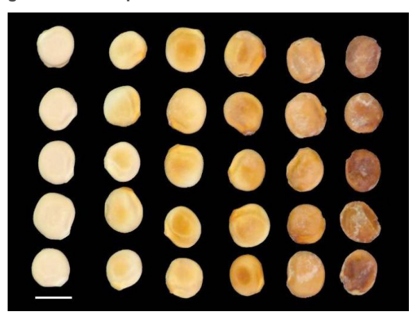
Figure 5: Phomopsis-infected broad-leaf lupin seed sorted into categories based on degree of discolouration. Seed was sorted into these categories (0 on left, 5 on right) and sown in a germination experiment

Delayed harvest may increase phomopsis infection if weather conditions are suitable. In years with dry summers lupins that are not harvested can generally be grazed safely, provided they have been inspected for signs of infection. In wet summers however, the risk of lupinosis occurring is greater.