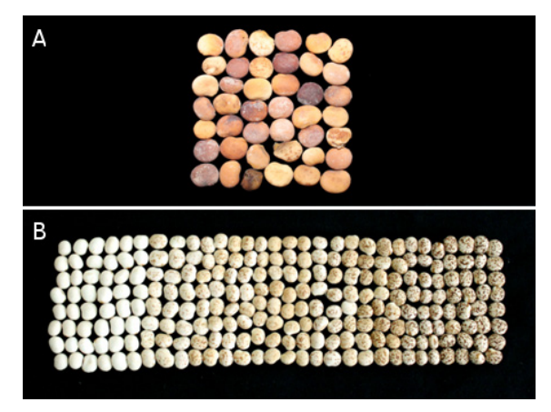
Figure 2. A; Phomopsis infected Narrow-leaf lupin seed. Note the golden-tan colour, see Figure 5 for Albus lupin. B; The range in seed mottling between different varieties of Narrow-leaf lupin can make it difficult to detect Phomopsis infected seed. Bar = 10mm.

Animals suffering these effects of lupinosis are likely to perform poorly or have photosensitisation for some weeks after grazing lupin stubbles. Some die as liver damage progresses.